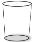
Cup (from home) to hold tube upright